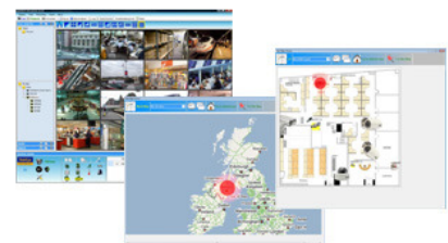
TeleEye site map module - siteMAP