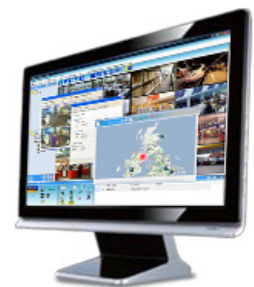
TeleEye sureSIGHT Business